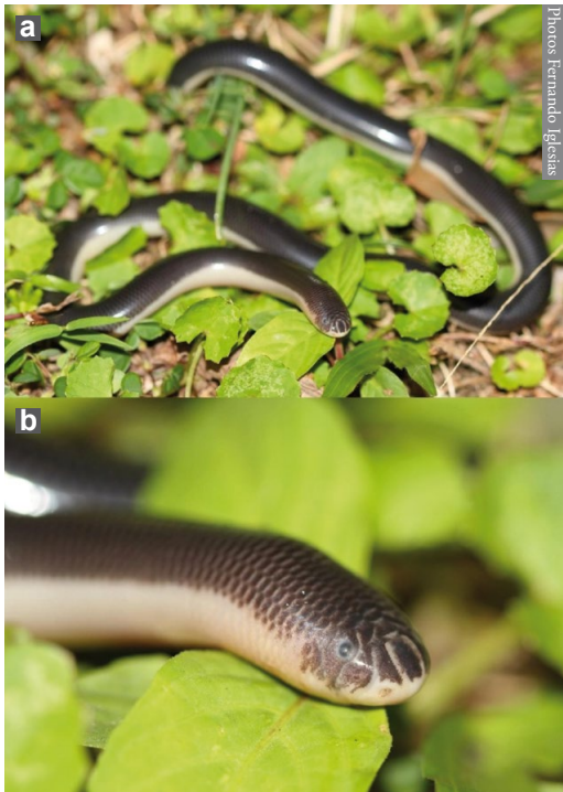
Figure 1: Recorded specimen of Argyrophis muelleri from Gunung Raya, Pulau Langkawi Malaysia: a) General view; b) Detail of the head.

During a field trip carried out across the island of Pulau Langkawi (Malaysia), on September 25 th , 2017 at 20:00 h, a single specimen of A. muelleri (Figure 1) was observed in a forest of the Gunung Raya mountain (6°22'08.6"N / 99°49'17.5"E; 734 masl) (Figures 2 and 3).