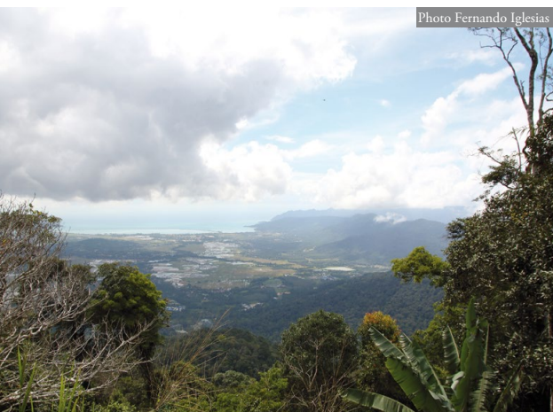
Figure 2: Habitat where the specimen of Argyrophis muelleri was found. Gunung Raya, Pulau Langkawi, Malaysia. Figura 2: Hábitat donde se encontró el ejemplar de Argyrophis muelleri . Gunung Raya, Pulau Langkawi, Malaysia.

The habitat, located in the Sunda Shelf bioregion (Wikramanayake et al. , 2002), was dominated by hardwood trees, such as Gluta , Shorea , Ficus , and Diospyros (Ehwan et al. , 2018) (Figure 2). This area is characterized by strongly seasonal climatic conditions, with a maximum tempe-